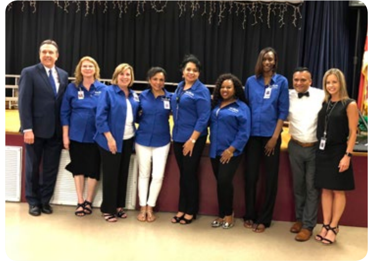
Staff from Seminole County Public Schools.

At the core of our district's vision for family engagement is serving the needs of the families in our school district. We communicate to families that they are not just "invited to participate," but also that we want to help develop or enhance their skills as parent leaders who are actively engaged with us in the common goal of academic and language success for their children throughout their academic career.