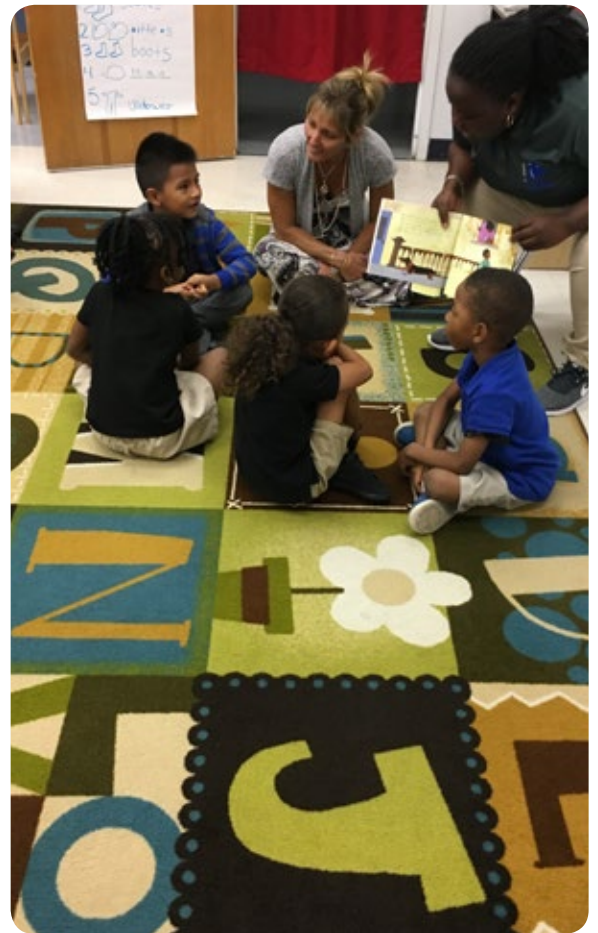
Staff and children from a PreK classroom in SDPBC