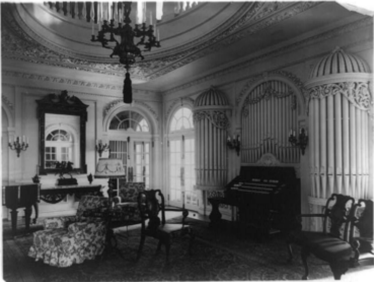
(c1909) Music Hall with Organ in house of John D. Rockefeller.

Students who receive explicit skill instruction are more prepared to apply those skills in different contexts and content areas. Skills that can be explicitly taught include